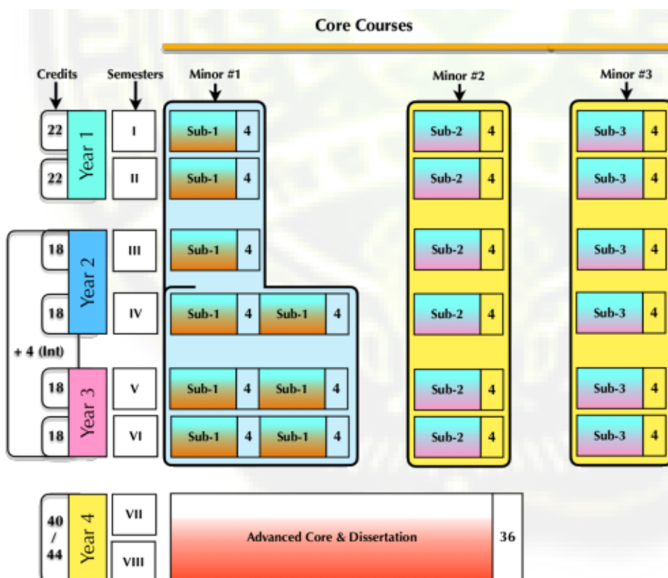
Fig: Student With no major Course

N.B.- Common Course will be the same for both the Student with major options and the (NOM) student with no major.